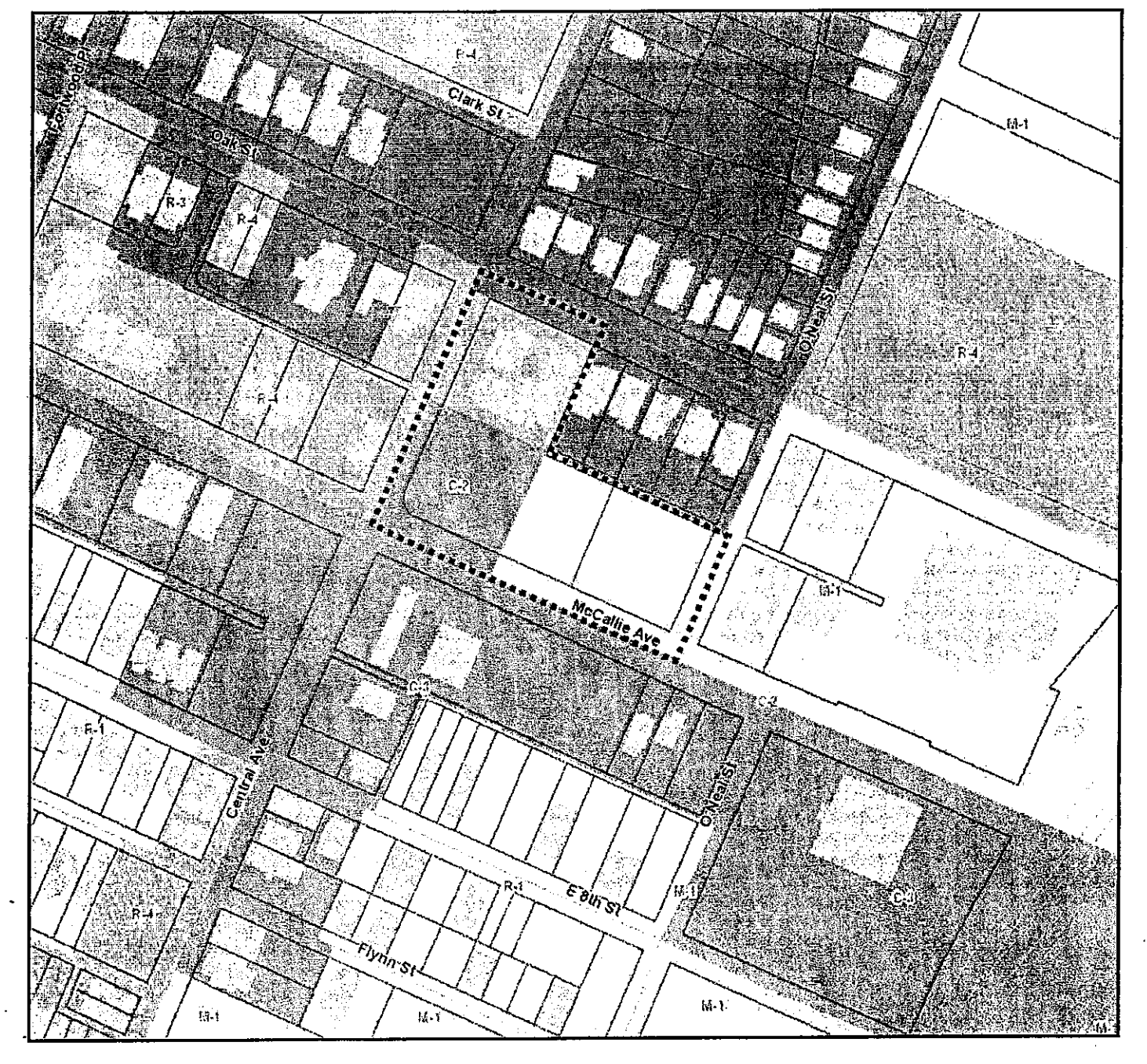
2015-007 Rezoning from C-2, M-1 and R-4 to C-3