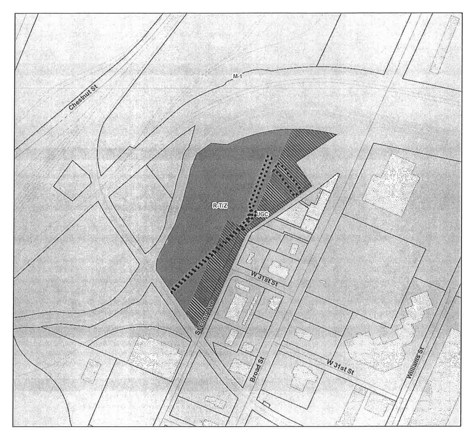
MR 2015-102 Sewer Easement Abandonment